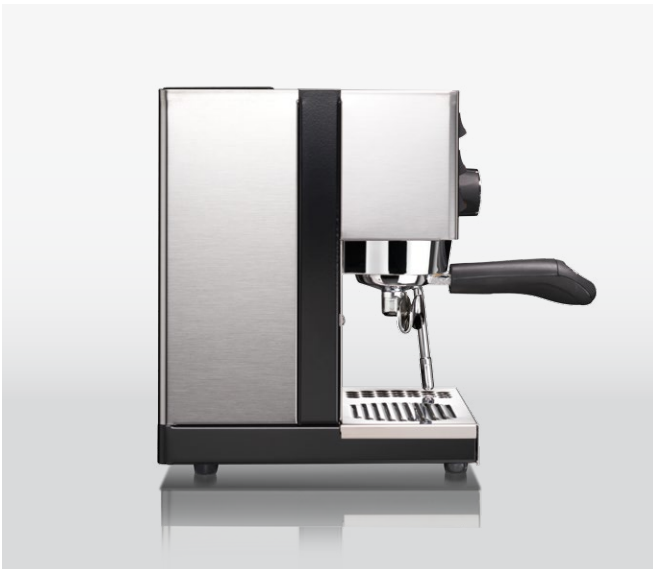
Silvia - side view