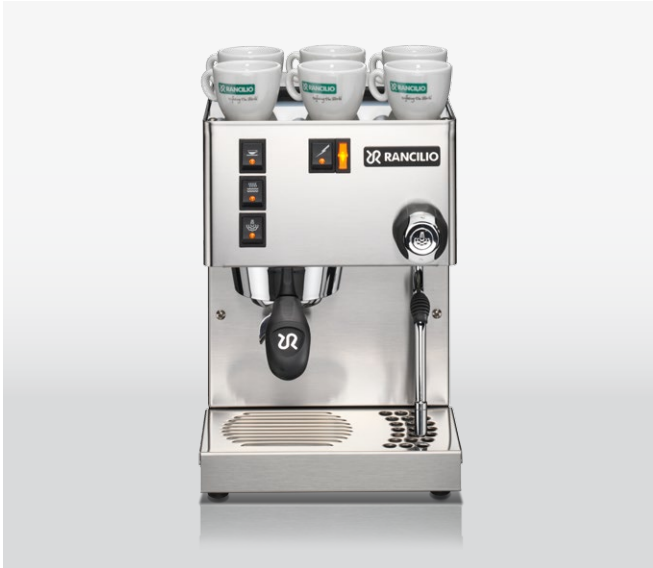
Silvia - front view